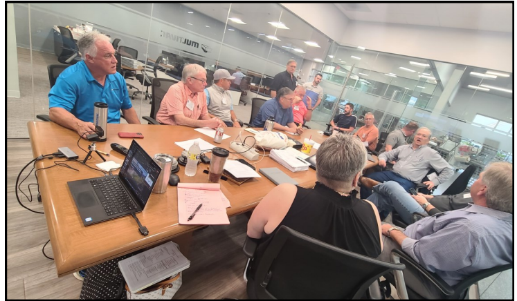
2021—National Country Ham Charlotte, NC