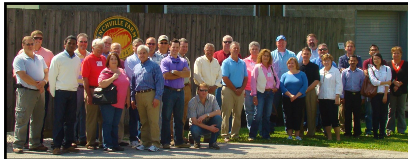
National-Country Ham Association at Finchville Farms, Finchville Kentucky, April 2012