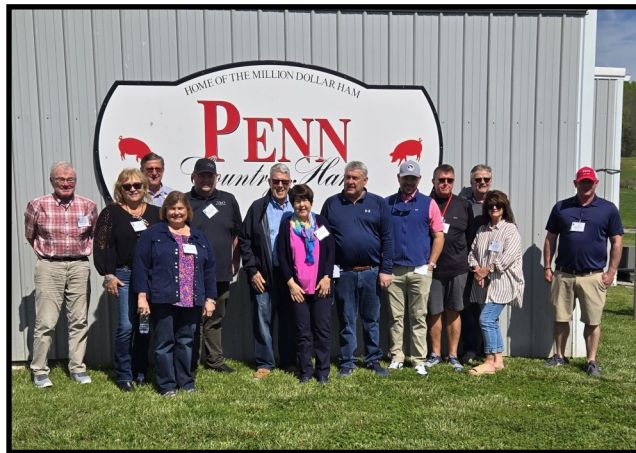
2025—National Country Ham