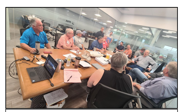
2021—National Country Ham Charlotte, NC

https://www.etix.com/ticket/p/88553980/general-admission-fridayapril-192024-lexington-general-admission?