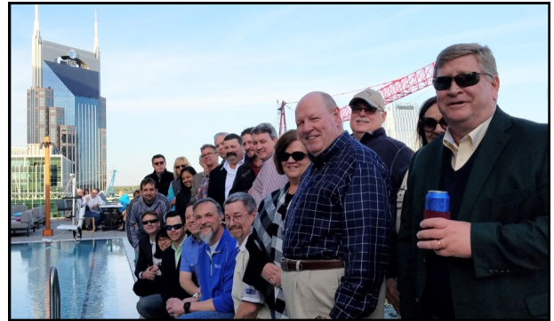
2018—National Country Ham Nashville, TN